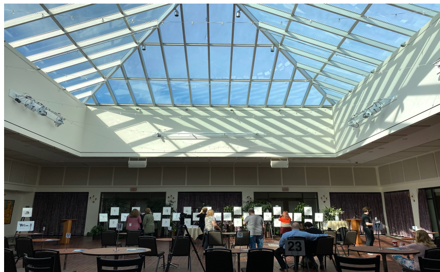
Preparing for Gifting Gathering, Ware Center Atrium, Millersville, University, Lancaster, PA