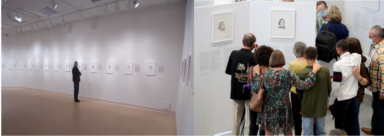
Daura Museum of Art, University of Lynchburg, November 2021