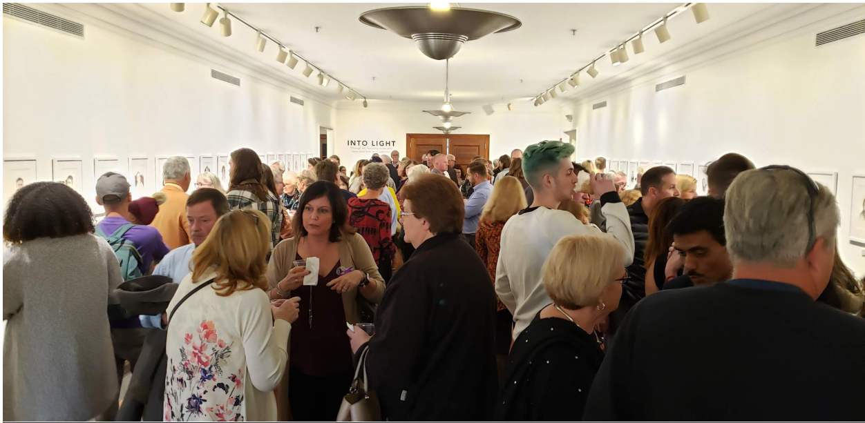
Opening Reception, Gromley Gallery, Notre Dame of Maryland University Baltimore, MD

Note: After the original exhibition, there is an option to participate in our “Continuing the Conversation” program.